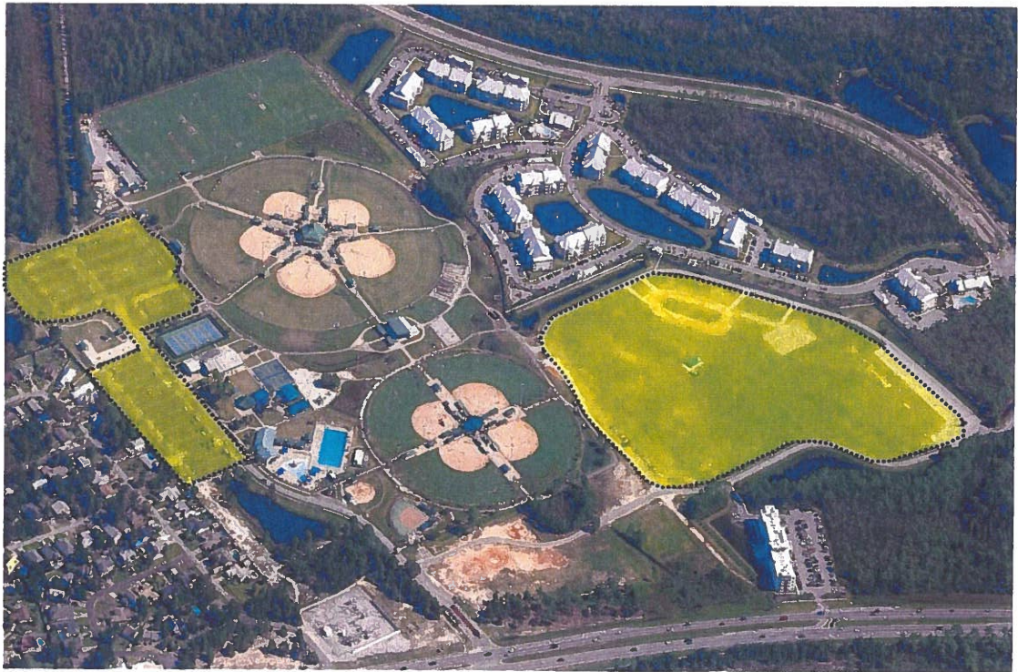
Highlighted area shows the available areas that Florida Power & Light can use for staging. No staging can take place on Baseball Fields or Soccer Fields.