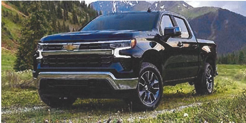
Note:Photo may not represent exact vehicle or selected equipment.

Vehicle: [Fleet] 2023 Chevrolet Silverado 1500 (CK10543) 4WD Crew Cab 147" Work Truck (✔ Complete)