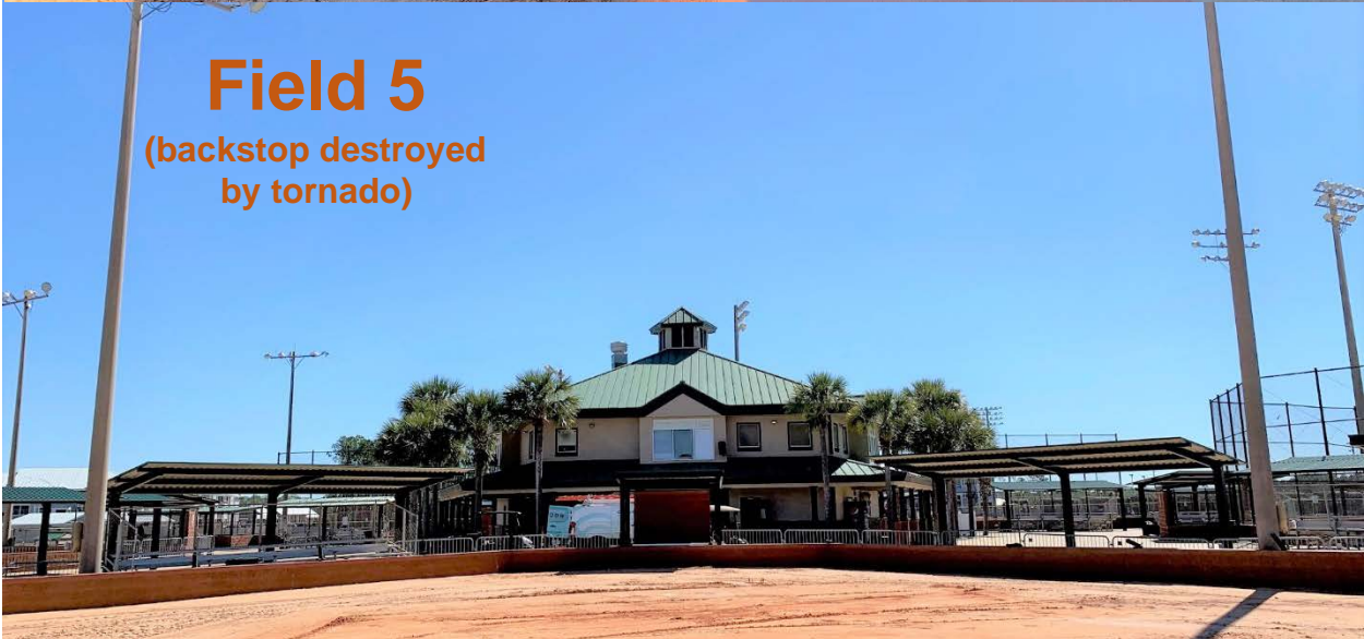
Field 5 (backstop destroyed by tornado)