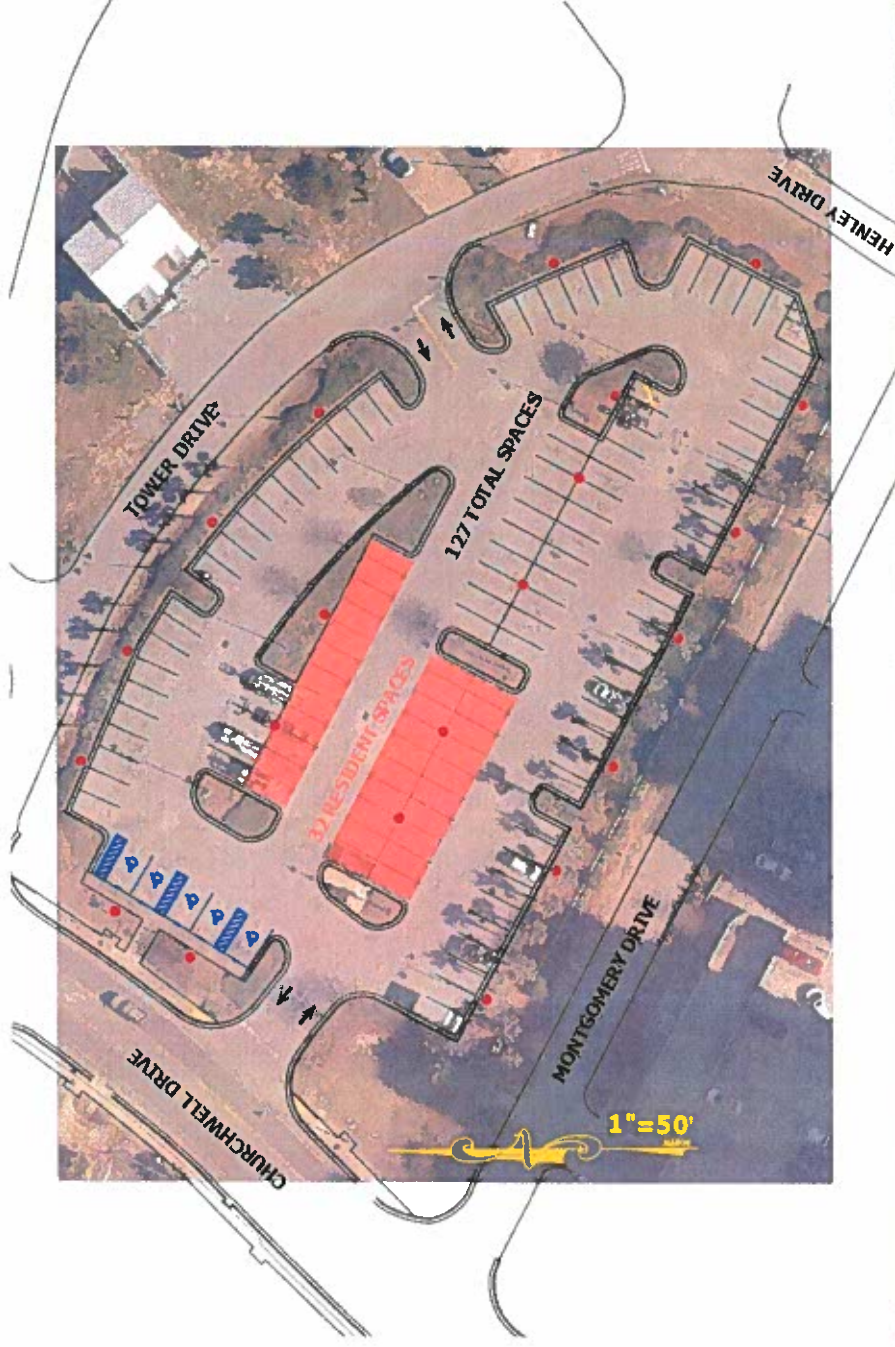
CHURCHWELL DRIVE PARKING LOT