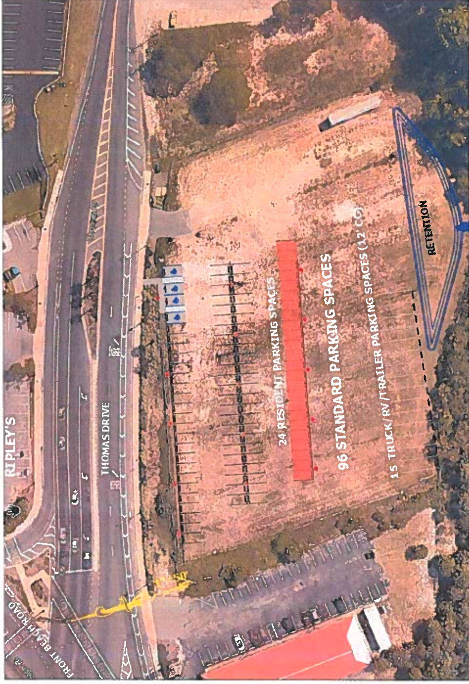
THOMAS DRIVE PARKING LOT AT RIPLEY'S