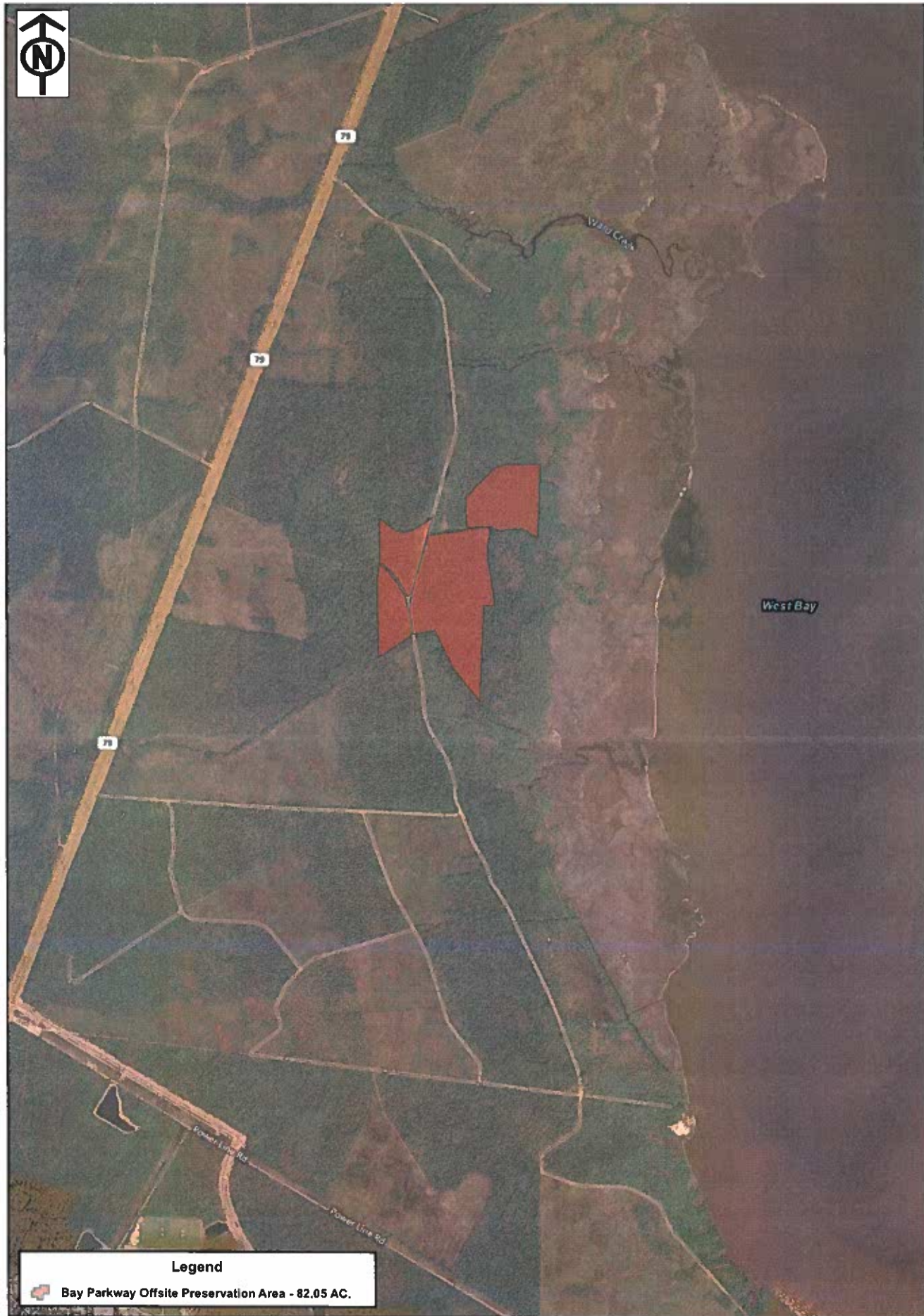
Exhibit A Off-site Conservation Easement

Bay Parkway TRS: T03S, R16W Sec 4 and 5 County: Bay State: Florida Imagery: Bing Hybrid