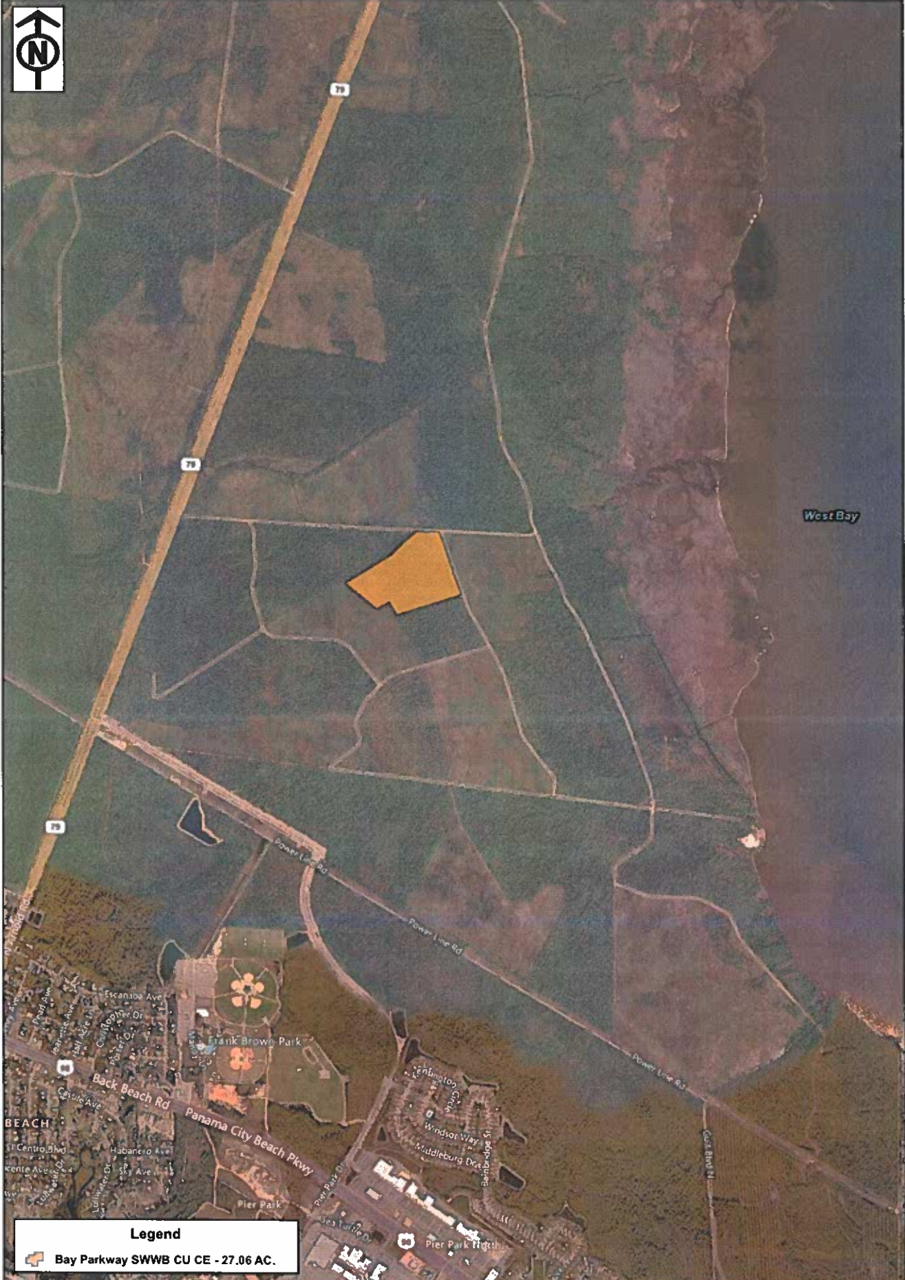
Exhibit B Annual Conservation Unit Conservation Easement

Bay Parkway TRS: T03S, R16W Sec 5 and 8 County: Bay State: Florida Imagery: Bing Hybrid